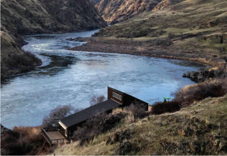
*Picture is before solar array addition