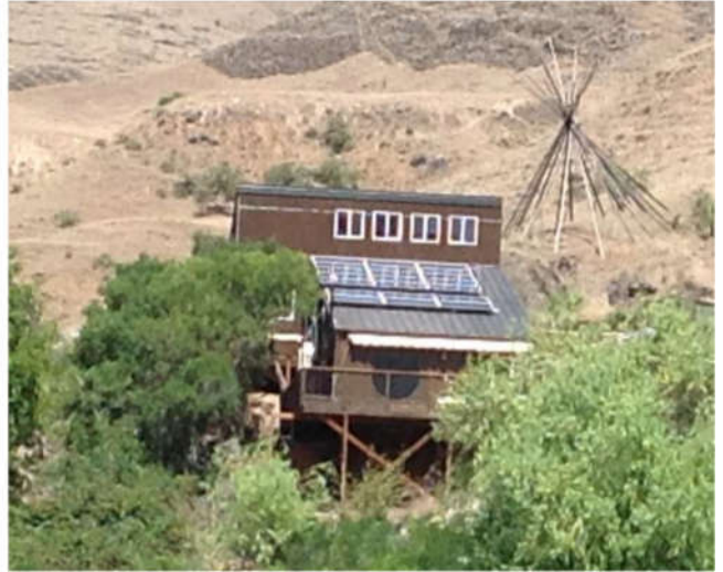
*Picture including Solar Panel Addition

Located in Hells Canyon of the Snake River RM195.1