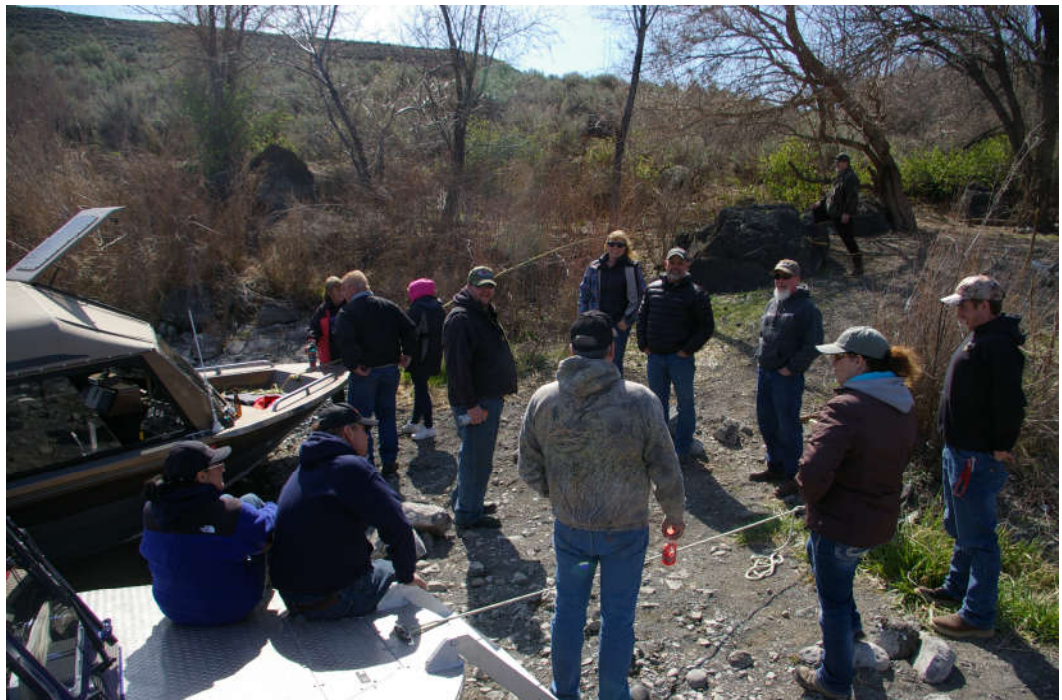
Gathering around at beach just above Pilgrim Rapid