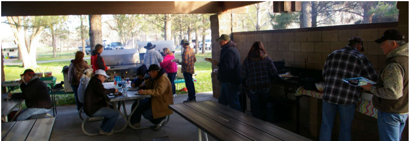
Another enjoyable meal and fellowship with other WWA members