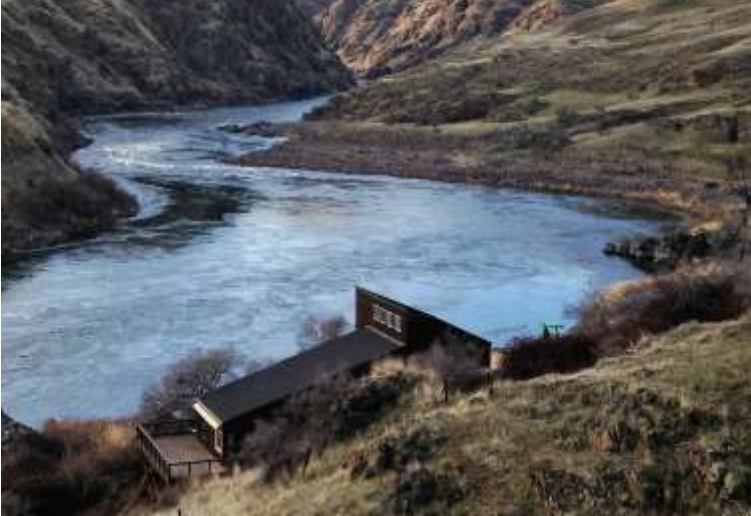
*Picture is before solar array addition