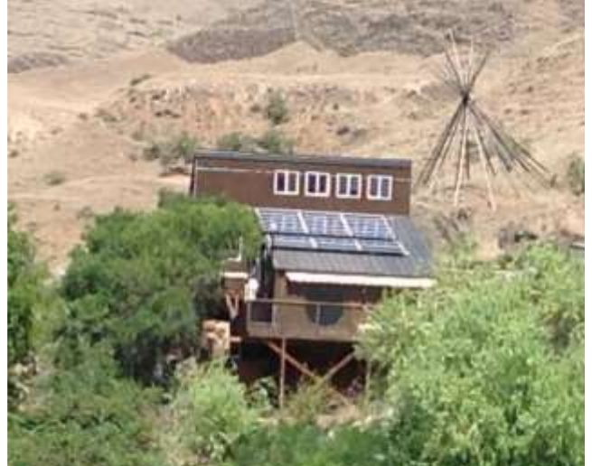
*Picture including Solar Panel Addition

Located in Hells Canyon of the Snake River RM195.1 Offered at $1,500,000.00