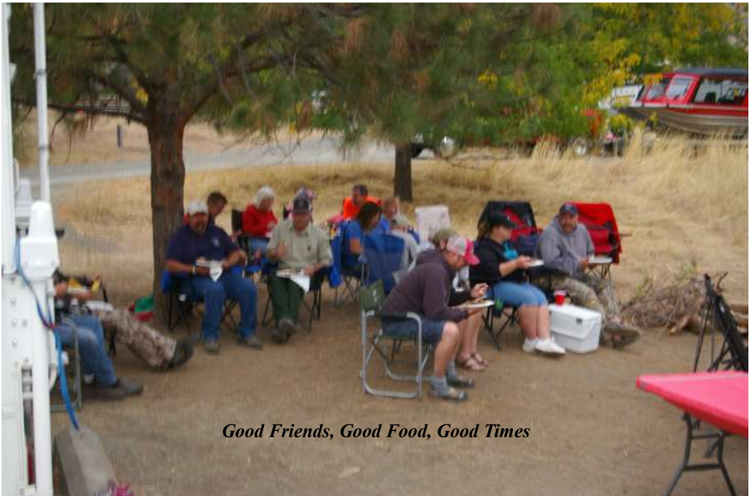
Good Friends, Good Food, Good Times

For the most part it was a great boating trip. Some new people saw the canyon for the first time. Lots of fish were caught. Chucker hunting was real good. Only a few minor dings and scratches. With all boats making it back on to the trailer safely. And best of all the club pump was not needed like last year ha ha. Thanks to everyone who attended and anyone we forgot to thank for making it a