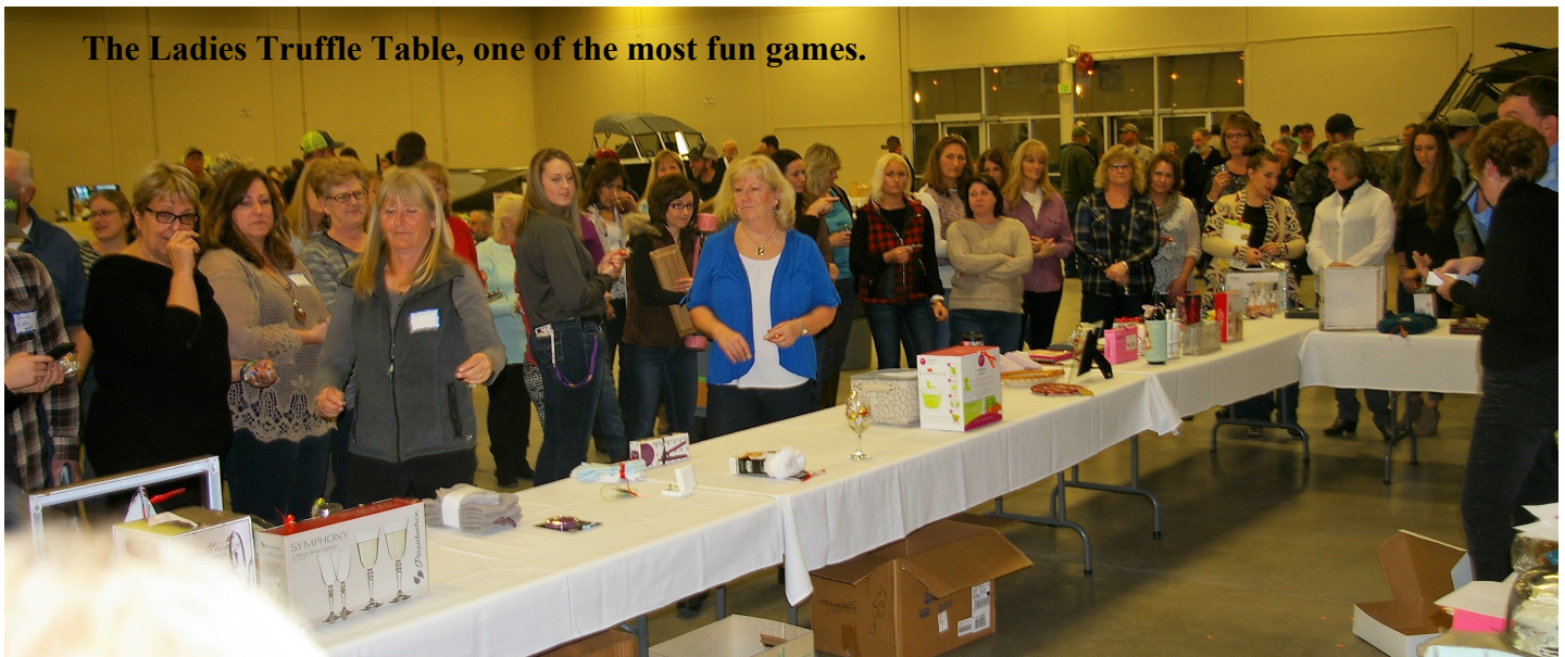
The Ladies Truffle Table, one of the most fun games.