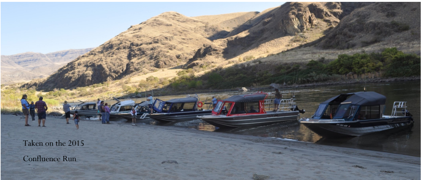
Taken on the 2015