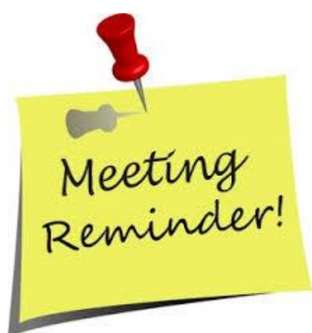
July 11<sup>th</sup> General Meeting 7:00 pm July 11<sup>th</sup> Board Meeting 8:00 pm August 8<sup>th</sup>General Meeting 7:00 pm Meetings @ Bob's Restaurant