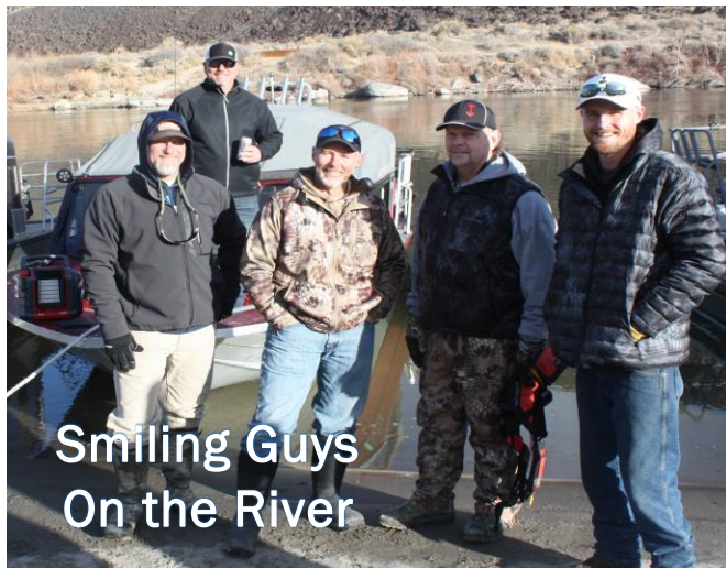
Smiling Guys On the River

We had a few people show up at Celebration for the BBQ, which was fantastic. Thank you to all our cooks and boat captains leading the way up the river.