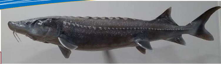
Featured Banquet Auction Item - 60" Sturgeon Replica by Pro Fish

General Membership Meetings are held at 7PM at Fiesta Guadalajara, 1202 N Jacob Alcott Way, Nampa, ID 83687.