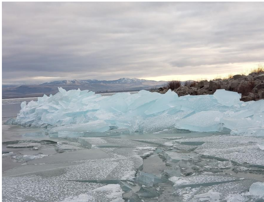
Wind and Ice - December 2020, American Falls Reservoir - Photo by Steve Reidy